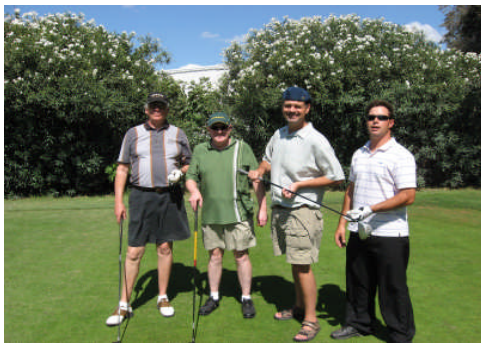
2007 S.O.M.E. Friends Golf Tournament 1 st Place team

We would like to thank all the players, sponsors, and volunteers that made this event a success.